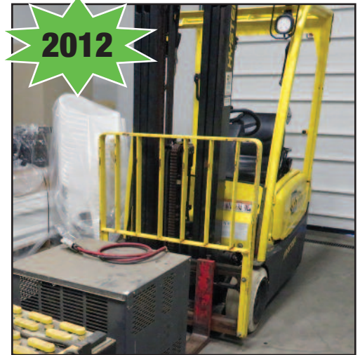
Hyster J30XNT Electric Forklift