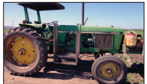
JD 2950 Tractor