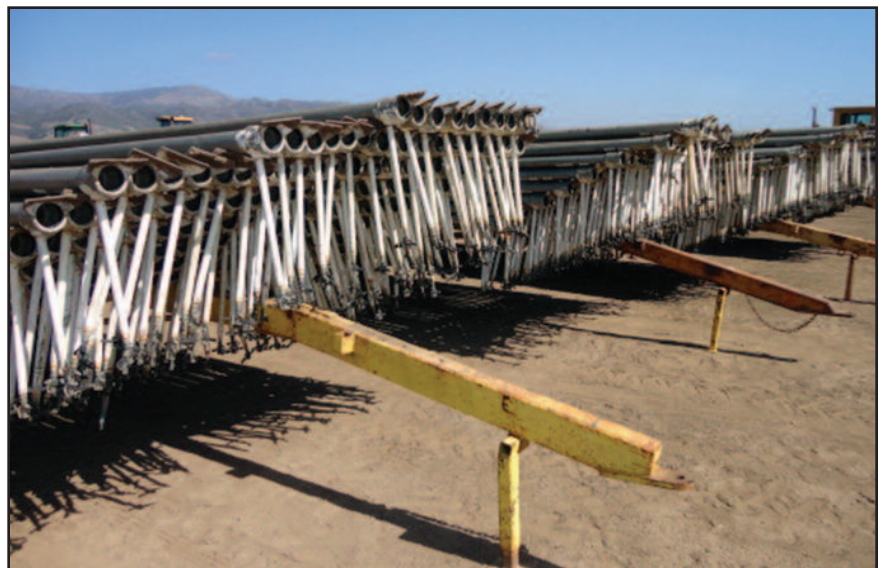
View of Irrigation Pipe