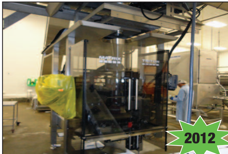
Matrix Triton Form-Fill-Bagger