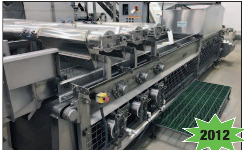
Reyco Vibratory Drying & Andgar Fog Tunnel