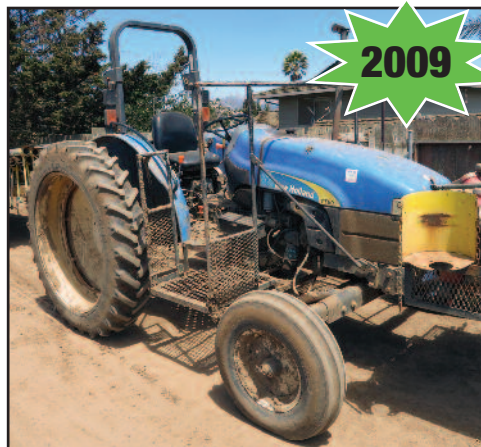
New Holland TT60A Tractor