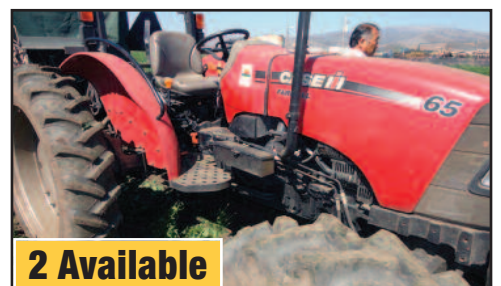
Case 65 MFWD Tractors