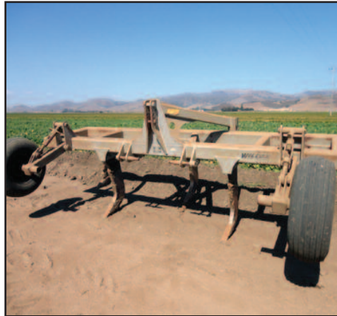
Wilcox MATB5-40 5-Shank Ripper