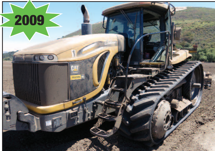
Challenger MT855C Crawler

Fiat 80-75 Crawler Mudder Tractor, S/N 47556