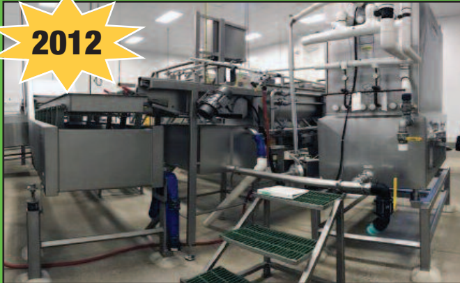
NSEP Cold Water Rinse Line with Mueller Chiller