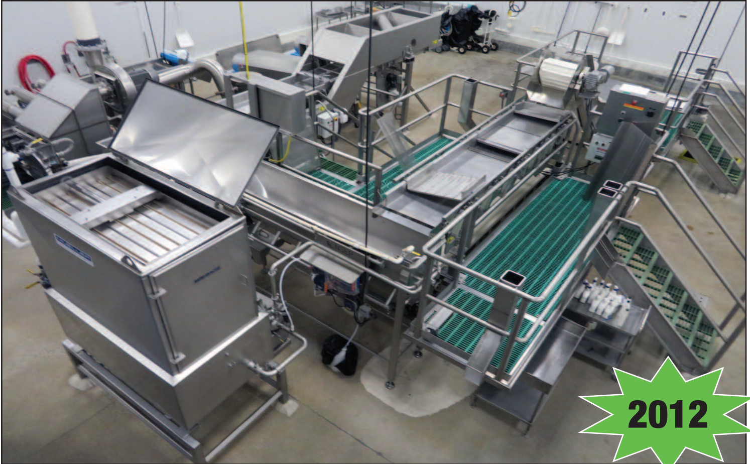
Overall View of Fresh Pack Processing Line

EXCLUSIVE RIGGER FOR THE VEGETABLE PROCESSING PLANT ONLY Advanced Riggers, Jerry Huffman (714) 272-9911