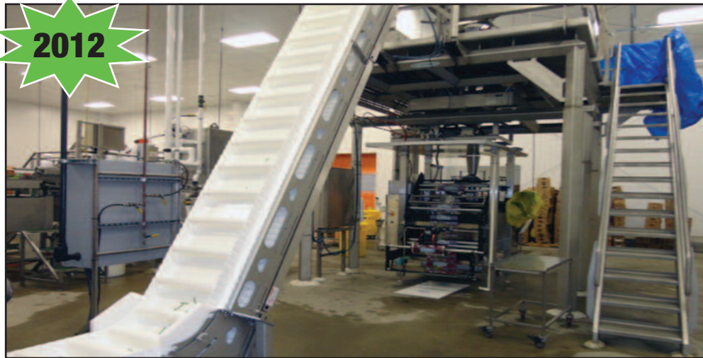
H&C Incline to Packaging Department