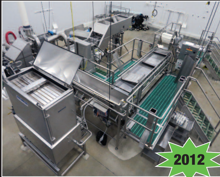
Overall View of Fresh Pack Processing Line