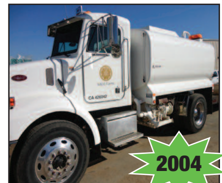
(2004) Pete 2,000 Gal. Water Truck