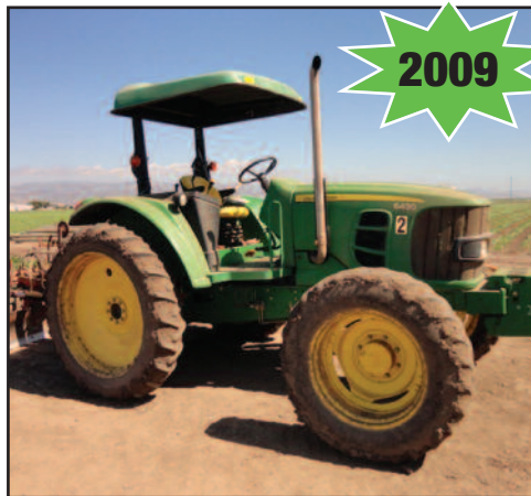
JD 6430 Tractor