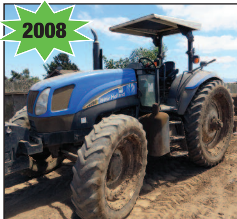
New Holland T6050 Tractor