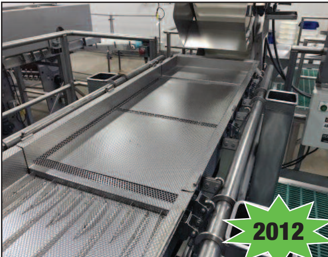
Meyer Vibratory Inspection Line