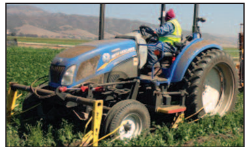
New Holland T4.75 Tractor & Bean Harvester