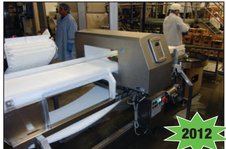
CEIA THS 21 Metal Detector