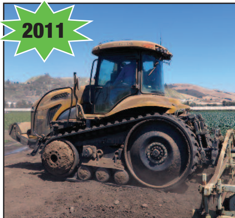
Challenger MT765C Crawler Tractor