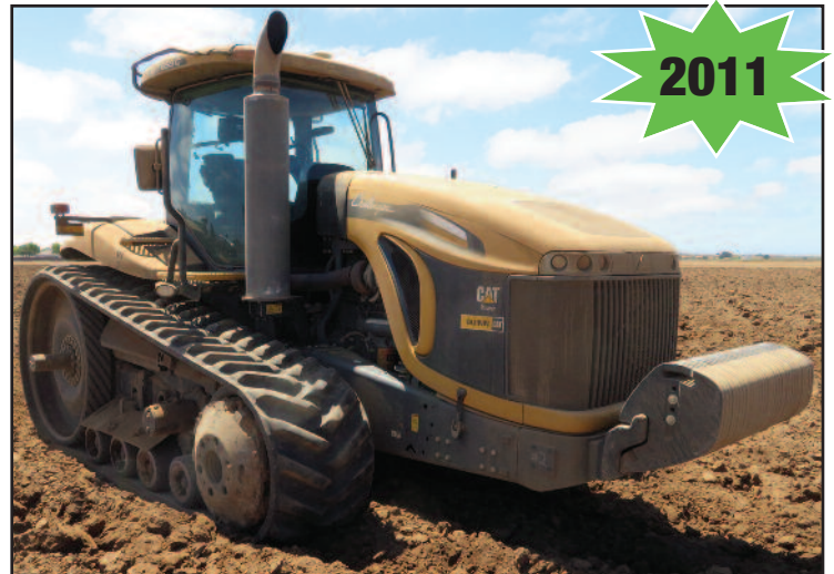
Challenger MT855C Crawler