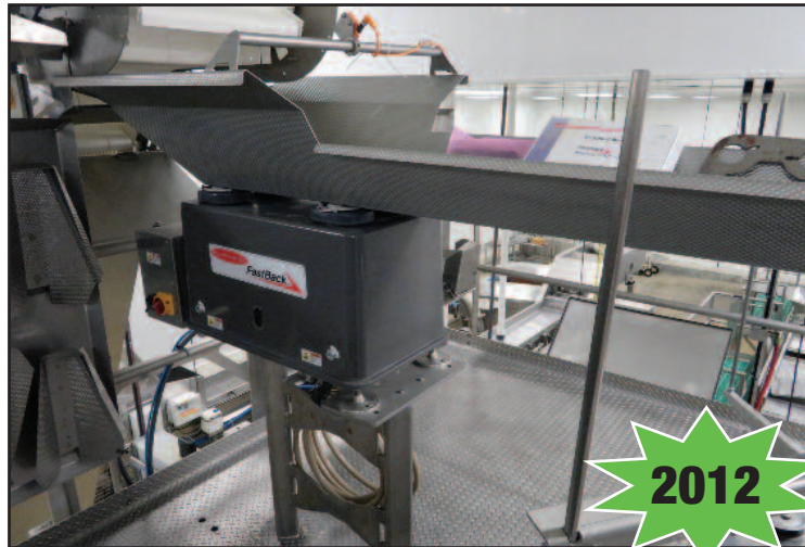
H&C Fast Back 260E-Gw Feeder